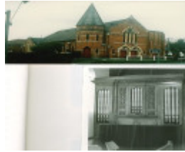
B5966 Uniting Church & Organ