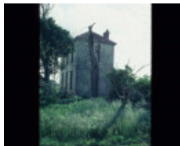
DAWKIN HOUSE, MALINGS ROAD, PORTLAND