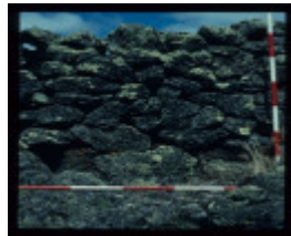
Lake Condah complex C