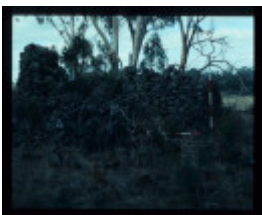
Lake Condah complex C