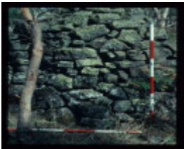
Lake Condah complex C