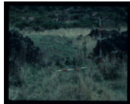
Lake Condah complex C