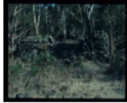
Lake Condah complex C