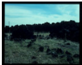
LAKE CONDAH - COMPLEX G