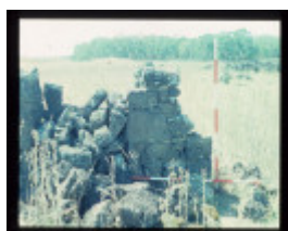
LAKE CONDAH - COMPLEX G FEATURE