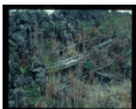
LAKE CONDAH - COMPLEX G FEATURE