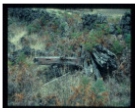
LAKE CONDAH - COMPLEX G FEATURE