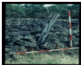
LAKE CONDAH - COMPLEX G FEATURE