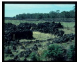
LAKE CONDAH - COMPLEX G