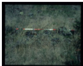
LAKE CONDAH - COMPLEX G FEATURE