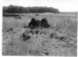
Chimney butt and footings for timber building (H7221-0229), facing south-west