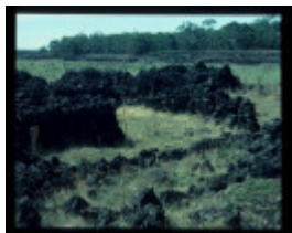
LAKE CONDAH - COMPLEX G