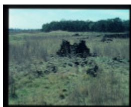
LAKE CONDAH - COMPLEX G FEATURE