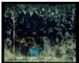
LAKE CONDAH - COMPLEX G FEATURE