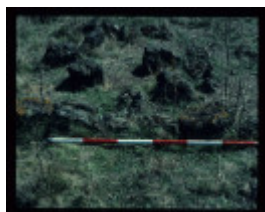
LAKE CONDAH - COMPLEX G FEATURE