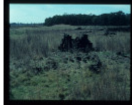
LAKE CONDAH - COMPLEX G FEATURE