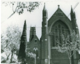
B5709 St Alban's Anglican Church