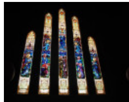
B5709 St Albans Church front window