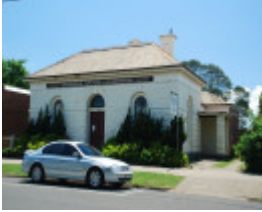
NATIONAL AUSTRALIA BANK SOHE 2008