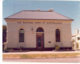
h00399 1 national bank maffra 1977