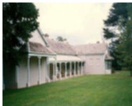
B1381 Coombe Cottage