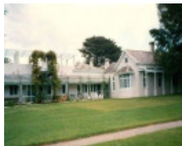
B1381 Coombe Cottage