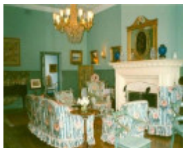
B1381 Coombe Cottage Music Room