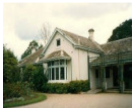
B1381 Coombe Cottage