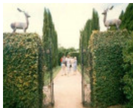
B1381 Coombe Cottage Garden