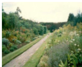
B1381 Coombe Cottage Garden