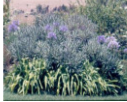
B3517 Gulf Station Garden