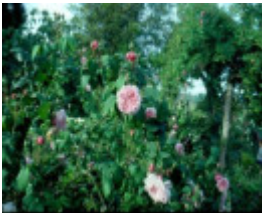
B3517 Gulf Station Garden