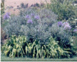
B3517 Gulf Station