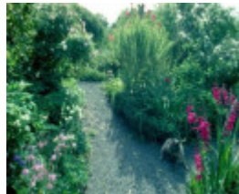
B3517 Gulf Station Garden