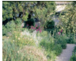
B3517 Gulf Station Garden