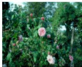
B3517 Gulf Station Garden