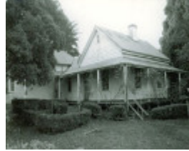
B3517 Gulf Station