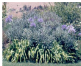
B3517 Gulf Station Garden