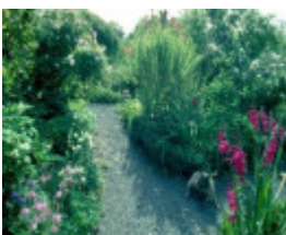
B3517 Gulf Station Garden