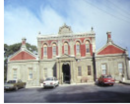
1 maldon district hospital chapel street maldon front elevation aug1984