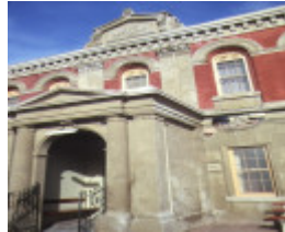
maldon district hospital chapel street maldon detail of front entrance aug1984