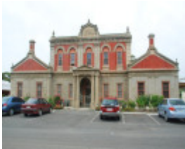
MALDON DISTRICT HOSPITAL SOHE 2008