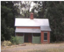
maldon district hospital chapel street maldon isolation ward dec1997