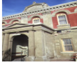
maldon district hospital chapel street maldon detail of front entrance aug1984