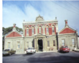
1 maldon district hospital chapel street maldon front elevation aug1984