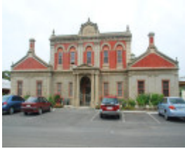
MALDON DISTRICT HOSPITAL SOHE 2008