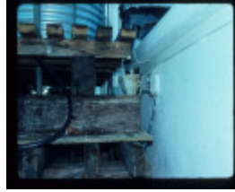
GREAVES COTTAGE FEATURE