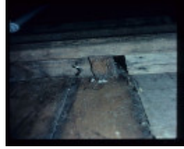
GREAVES COTTAGE FEATURE