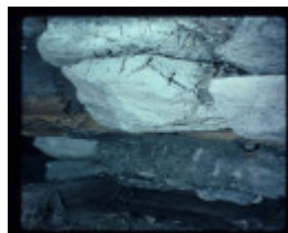
GREAVES COTTAGE FEATURE