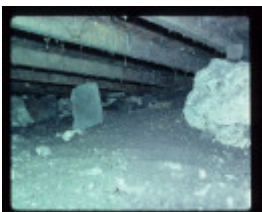
GREAVES COTTAGE FEATURE