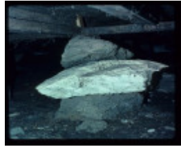
GREAVES COTTAGE FEATURE