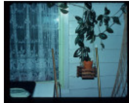
GREAVES COTTAGE FEATURE