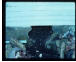
GREAVES COTTAGE FEATURE