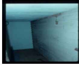
GREAVES COTTAGE FEATURE