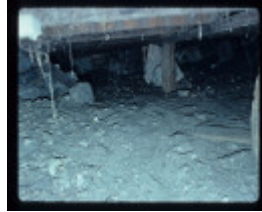
GREAVES COTTAGE FEATURE