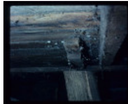
GREAVES COTTAGE FEATURE