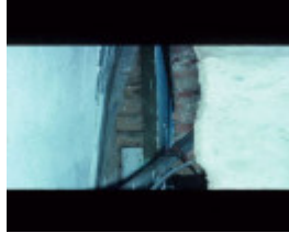
GREAVES COTTAGE FEATURE