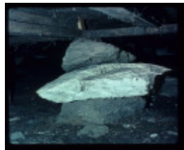
GREAVES COTTAGE FEATURE