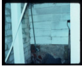
GREAVES COTTAGE FEATURE