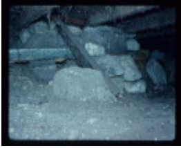
GREAVES COTTAGE FEATURE