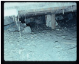
GREAVES COTTAGE FEATURE