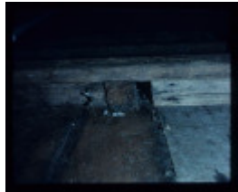
GREAVES COTTAGE FEATURE