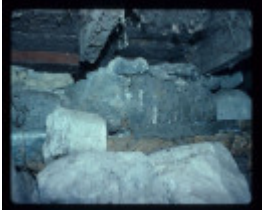
GREAVES COTTAGE FEATURE