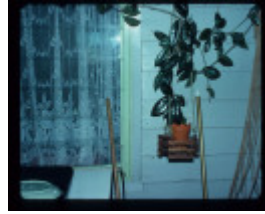
GREAVES COTTAGE FEATURE