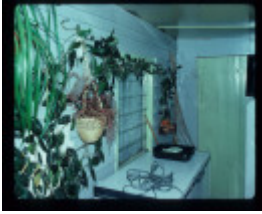
GREAVES COTTAGE FEATURE