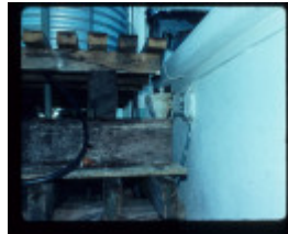
GREAVES COTTAGE FEATURE