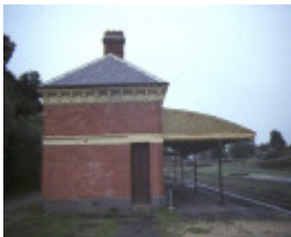
maldon railway station complex hornsby street maldon side view