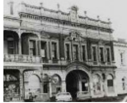
B3565 Fmr Mining Exchange