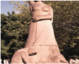
B7198 Pinkerton Statue