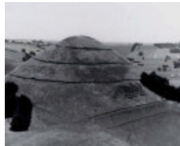
L10155 Mt Sugarloaf