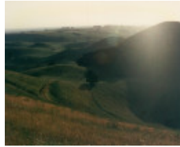
L10155 Mt Leura Complex