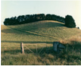
L10155 Mt Leura Complex