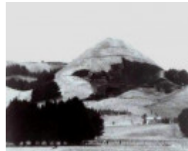
L10155 Mt Sugarloaf