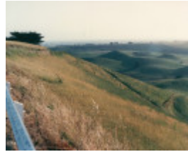
L10155 Mt Leura Complex