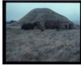
NEW LANGI LOGAN NO.1