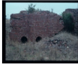
NEW LANGI LOGAN NO.1