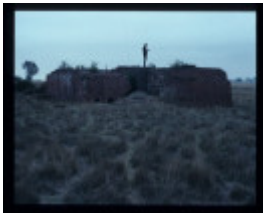
NEW LANGI LOGAN NO.1