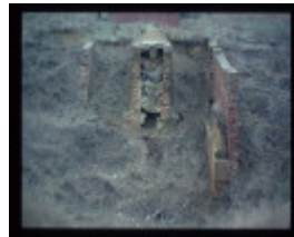
NEW LANGI LOGAN NO.1