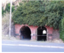
BALLARAT RAILWAY COMPLEX SOHE 2008