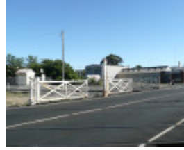
BALLARAT RAILWAY COMPLEX SOHE 2008