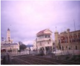
ballarat railway complex site view