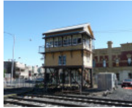
BALLARAT RAILWAY COMPLEX SOHE 2008