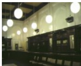
ballarat railway complex interior of station building