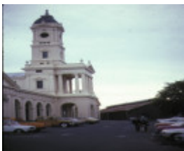
1 ballarat railway complex front view with tower feb1984