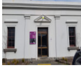
Modern and highly intrusive entry door to the north side station building