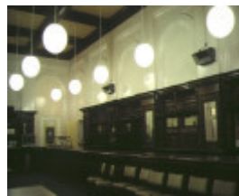
ballarat railway complex interior of station building