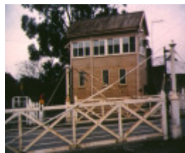
ballarat railway complex signal box & gates