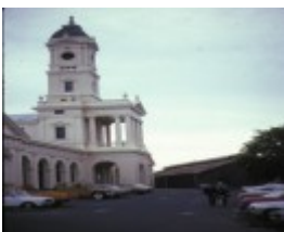
1 ballarat railway complex front view with tower feb1984