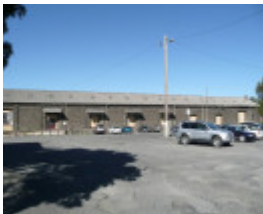
BALLARAT RAILWAY COMPLEX SOHE 2008