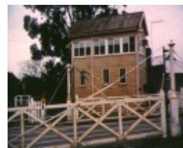
ballarat railway complex signal box & gates