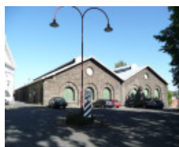
BALLARAT RAILWAY COMPLEX SOHE 2008