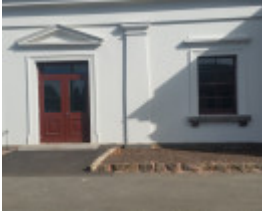
Reconstructed pedimented entry to north side station building refer P20705