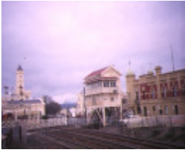
ballarat railway complex site view