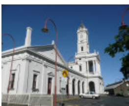
BALLARAT RAILWAY COMPLEX SOHE 2008