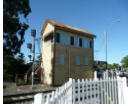
BALLARAT RAILWAY COMPLEX SOHE 2008