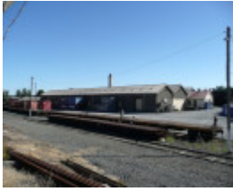
BALLARAT RAILWAY COMPLEX SOHE 2008