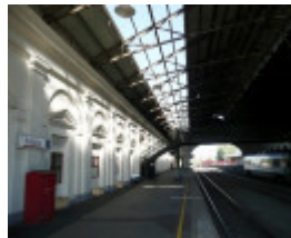
BALLARAT RAILWAY COMPLEX SOHE 2008