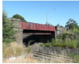
BALLARAT RAILWAY COMPLEX SOHE 2008