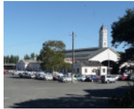
BALLARAT RAILWAY COMPLEX SOHE 2008