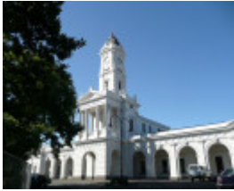
BALLARAT RAILWAY COMPLEX SOHE 2008