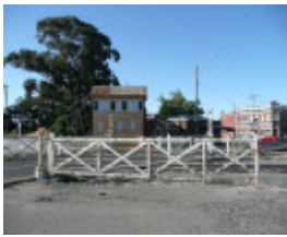
BALLARAT RAILWAY COMPLEX SOHE 2008