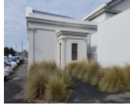
Reconstructed entry porch, north side station building refer P20705