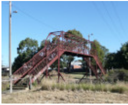
BALLARAT RAILWAY COMPLEX SOHE 2008