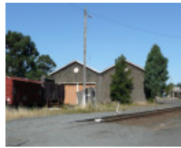
BALLARAT RAILWAY COMPLEX SOHE 2008