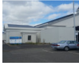
Reconstructed entry porch to the north side station building refer P20705