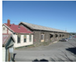
BALLARAT RAILWAY COMPLEX SOHE 2008