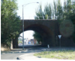
BALLARAT RAILWAY COMPLEX SOHE 2008