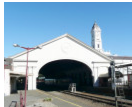
BALLARAT RAILWAY COMPLEX SOHE 2008