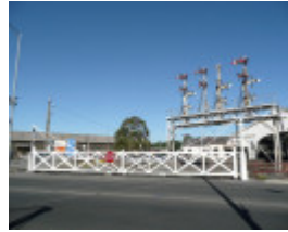
BALLARAT RAILWAY COMPLEX SOHE 2008