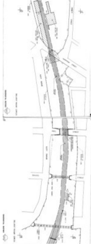
ballarat railway station registration plans3and4