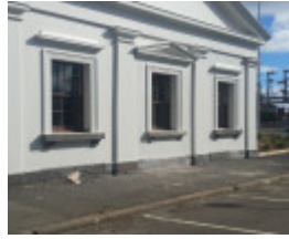
Reconstructed bay to the west end of the north side of station building refer P20705