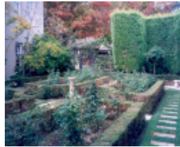
h00935 katanga glenferrie road malvern garden she project 2003