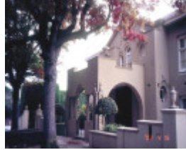
h00935 katanga glenferrie raod malvern front side view she project 2003