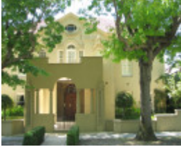
KATANGA SOHE 2008