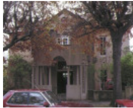
katanga glenferrie road malvern front elevation