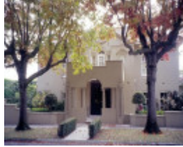
h00935 katanga glenferrie raod malvern front view she project 2003