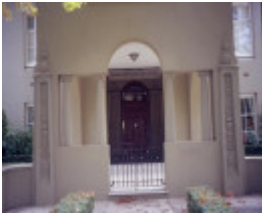
h00935 katanga glenferrie raod malvern front gate she project 2003