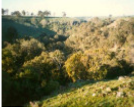
L10127 Barfold Gorge