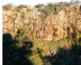
L10127 Barfold Gorge