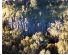
L10127 Barfold Gorge