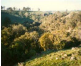
L10127 Barfold Gorge