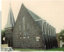
B3744 Church Of Christ