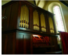
B3744 Church of Christ