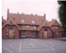
malvern primary school no 2586 tooronga road malvern infants school dec 97