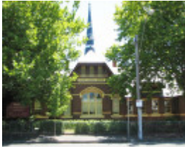
PRIMARY SCHOOL NO.2586 SOHE 2008