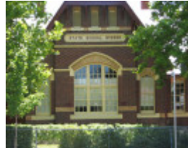
PRIMARY SCHOOL NO.2586 SOHE 2008