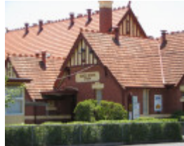
PRIMARY SCHOOL NO.2586 SOHE 2008