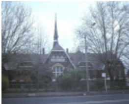
1 malvern primary school no 2586 tooronga road malvern front view