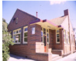
malvern primary school no 2586 tooronga road malvern domestic arts building