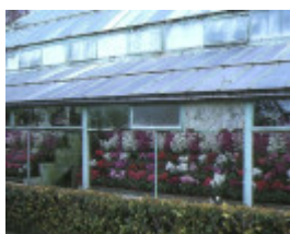
central park conservatory wattletree road malvern side view