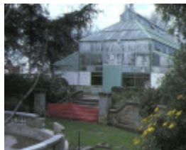
central park conservatory wattletree road malvern rear view