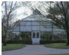
1 central park conservatory wattletree road malvern front view