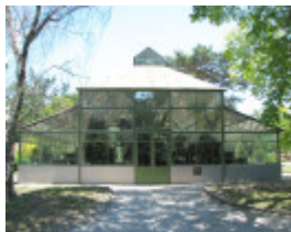
CENTRAL PARK CONSERVATORY SOHE 2008