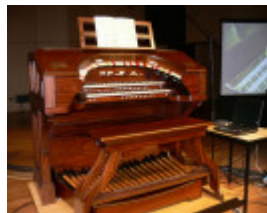
B6291 Wurlizer Organ