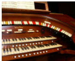
B6291 Wurlizer Organ