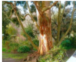
T12193 Angophora costata