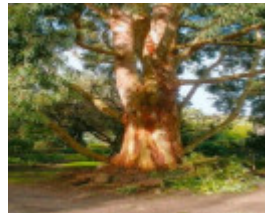
T12193 Angophora costata