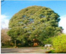
T12193 Angophora costata