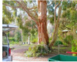
T12193 Angophora costata