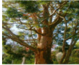
T12193 Angophora costata