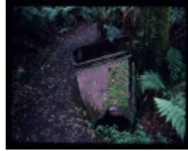
KNOTT'S NO.1 MILL