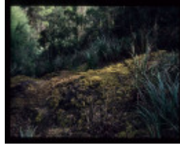
KNOTT'S NO.1 MILL