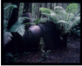
KNOTT'S NO.1 MILL