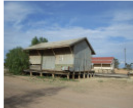
MANANGATANG RAILWAY STATION COMPLEX SOHE 2008