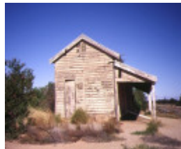
manangatang railway station wattle street manangatang side view apr1995