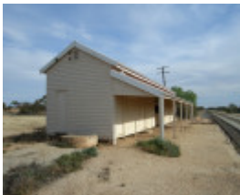
MANANGATANG RAILWAY STATION COMPLEX SOHE 2008