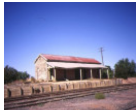
1 manangatang railway station complex wattle street manangatang rear view