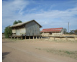
MANANGATANG RAILWAY STATION COMPLEX SOHE 2008