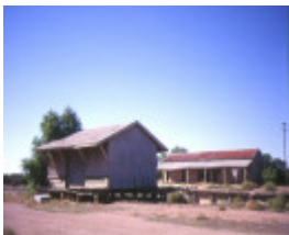
manangatang railway station complex wattle street manangatang goods shed apr1995