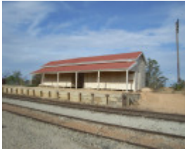
MANANGATANG RAILWAY STATION COMPLEX SOHE 2008