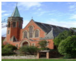
B5906 St Andrew's Presbyterian Church