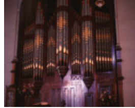
B2051 Kyneton Congregational 1970s