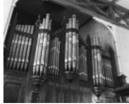
B2051 Former Kyneton Congregational Church