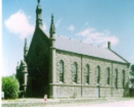
B2051 Former Congregational Church, Kyneton