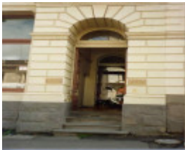
1 former es& a bank lydiard street north ballarat exterior entrance