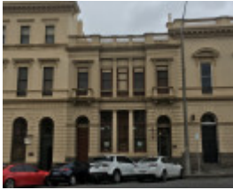
Former ANZ Bank