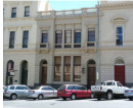
FORMER ANZ BANK SOHE 2008