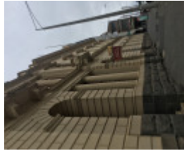
Former ANZ Bank 3