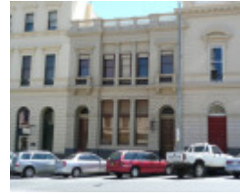
FORMER ANZ BANK SOHE 2008