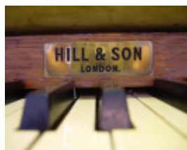
B4854 Hill Organ Ingrave UK