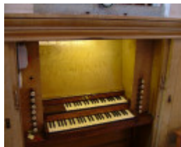
B4854 Hill Organ