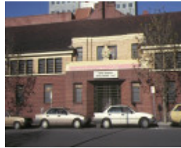
1 former royal australian army medical corps training depot a'beckett street melb front entrance 1990