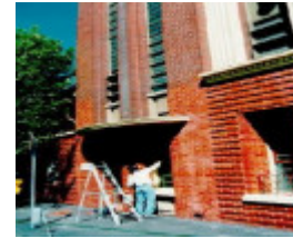
former royal australian army medical corps training depot a'beckett street melb facade detail