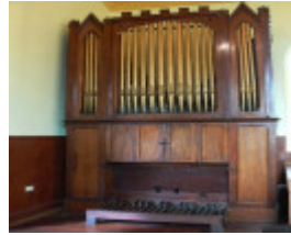
B2045 St Luke's Lutheran Church Pipe Organ