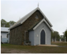
B2045 St Lukes Lutheran Church