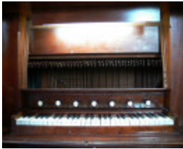
B2045 St Lukes Lutheran Church Pipe Organ