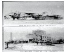
B6275 Euroa Butter Factory