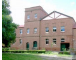
B6275 Euroa Butter Factory