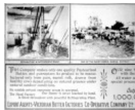
B6275 Euroa Butter Factory