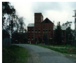
B6275 Euroa Butter & Ice Factory