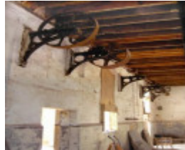
B6275 Euroa Butter Factory