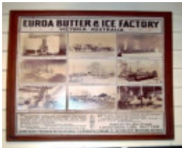
B6274 Euroa Butter Factory