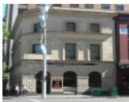
FORMER LONDON CHARTERED BANK SOHE 2008