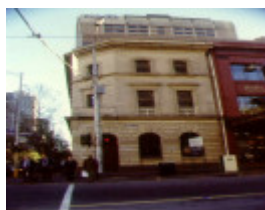
former london chartered bank bourke street elevation sw apr1999