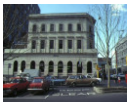
former london chartered bank melb external front