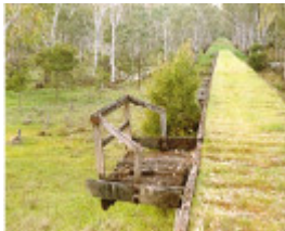
B6921 Fulham Railway Bridge deck