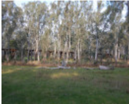
B6921 Fulham Rail Bridge