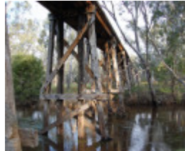
B6921 Fulham Rail bridge