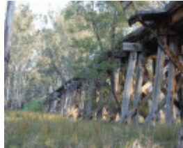
B6921 Fulham Rail Bridge