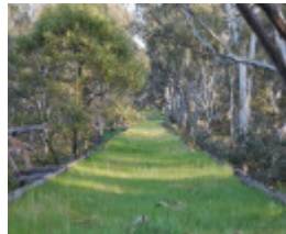
B6921 Fulham deck 2011