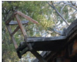
B6921 Fulham safety platform