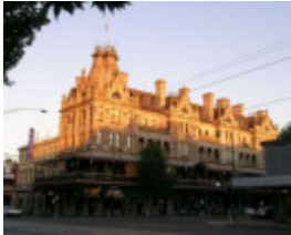
B1853 Shamrock Hotel