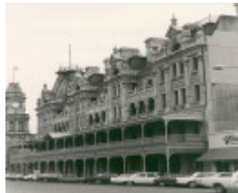
B1853 Shamrock Hotel