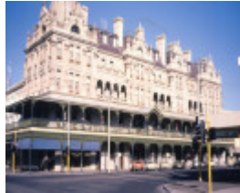
B1853 Shamrock Hotel