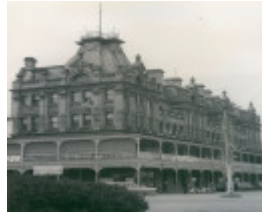
B1853 Shamrock Hotel