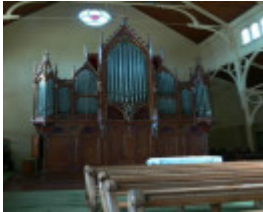
B3508 St Kilian's Catholic Church Pipe Organ