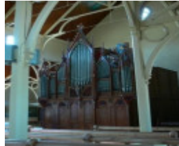
B3508 St Kilian's Catholic Church Pipe Organ