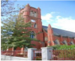
B2520 St Paul's Anglican Cathedral former St Paul's Church