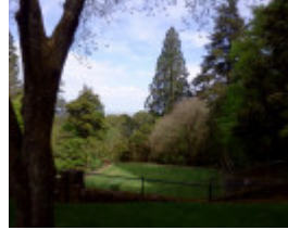
G13100 Alton Gardens