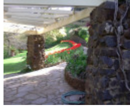
G13100 Alton Gardens