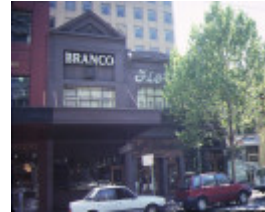
cafe florentino bourke street melbourne street view