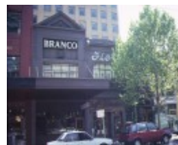
cafe florentino bourke street melbourne street view