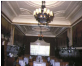
cafe florentino bourke street melbourne interior dining room