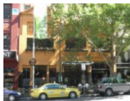
CAFE FLORENTINO SOHE 2008