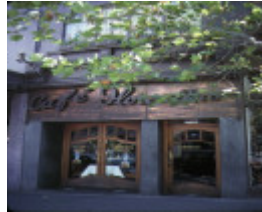
1 cafe florentino bourke street melbourne shop front