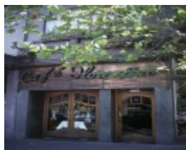
1 cafe florentino bourke street melbourne shop front