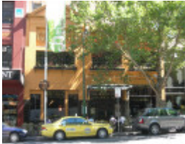
CAFE FLORENTINO SOHE 2008