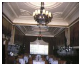
cafe florentino bourke street melbourne interior dining room