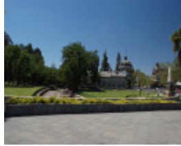
G13066 Rosalind Park