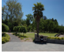
G13066 Rosalind Park