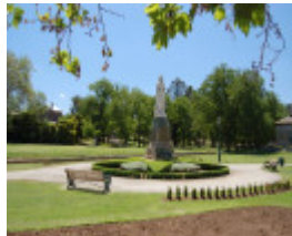
G13066 Rosalind Park