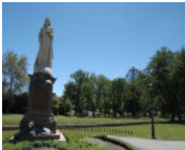
G13066 Rosalind Park