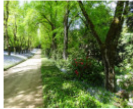
G13102 Duneira drive spring 12