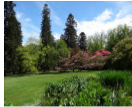
G13102 Duneira main lawn