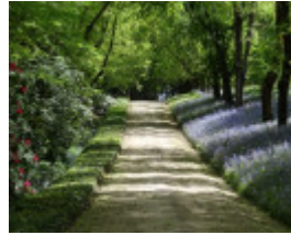
G13102 Duneira drive spring 12