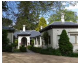
G13102 Duneira house entrance