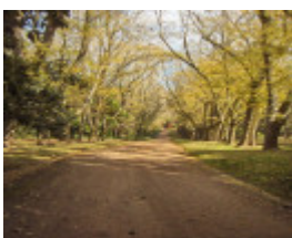
G13102 Duneira Garden