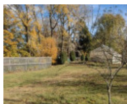
G13102 Duneira Garden 2007