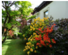
G13102 Duneira side garden