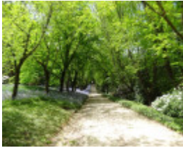
G13102 Duneira drive elms spring 12