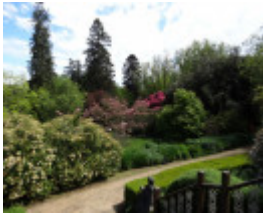
G13102 Duneira garden from house