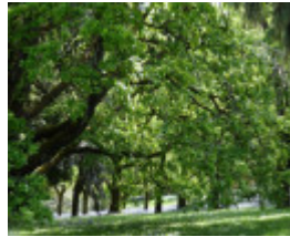
G13102 Duneira east lawn