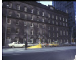
1 goldsbrough mort building bourke rd melb view front