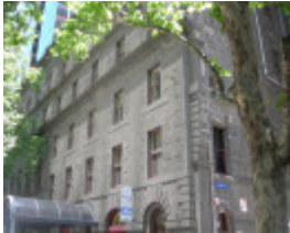
GOLDSBOROUGH MORT BUILDING SOHE 2008