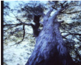
T11005 Eucalyptus cypellocarpa