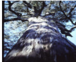
T11005 Eucalyptus cypellocarpa