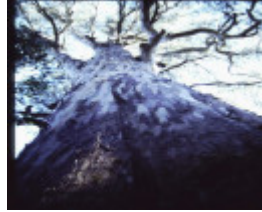
T11005 Eucalyptus cypellocarpa