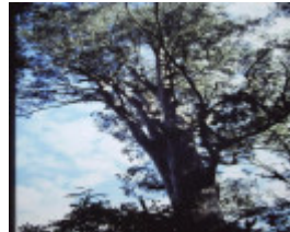
T11005 Eucalyptus cypellocarpa