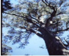
T11005 Eucalyptus cypellocarpa