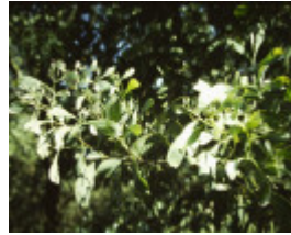
T11013 Acacia caerulescens