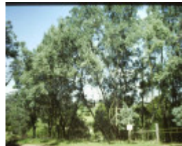
T11013 Acacia caerulescens