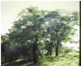
T11013 Acacia caerulescens