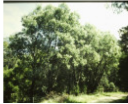
T11013 Acacia caerulescens