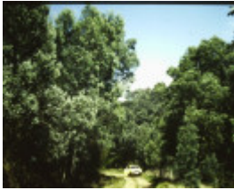
T11013 Acacia caerulescens