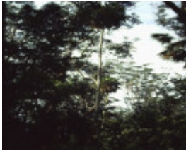
T11015 Livistona australis