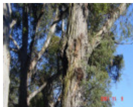
T11039_Eucalyptus elata_River Peppermint_Bark.jpg