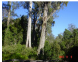
T11039_Eucalyptus elata_River Peppermint_1.jpg