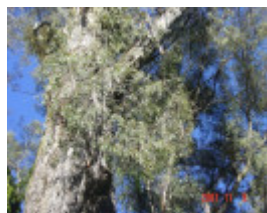
T11039_Eucalyptus elata_River Peppermint_Leaf.jpg