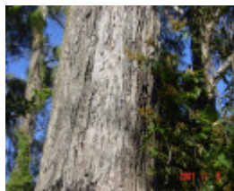
T11039_Eucalyptus elata_River Peppermint_Bark_2.jpg