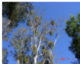
T11039_Eucalyptus elata_River Peppermint_4.jpg