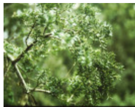
T11042 Podocarpus lawrencei