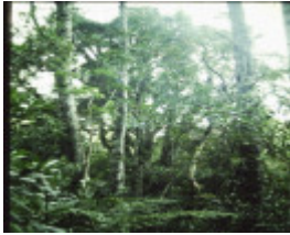
T11042 Podocarpus lawrencei