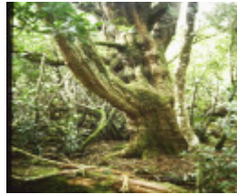
T11042 Podocarpus lawrencei