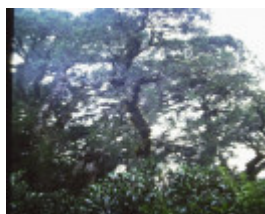
T11042 Podocarpus lawrencei