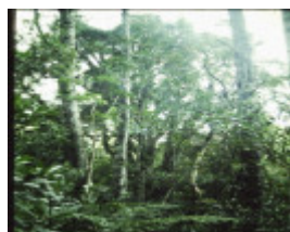
T11042 Podocarpus lawrencei