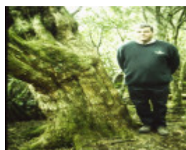
T11042 Podocarpus lawrencei