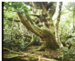
T11042 Podocarpus lawrencei