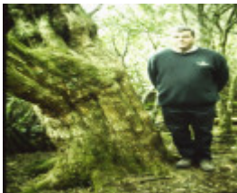
T11042 Podocarpus lawrencei