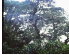
T11042 Podocarpus lawrencei