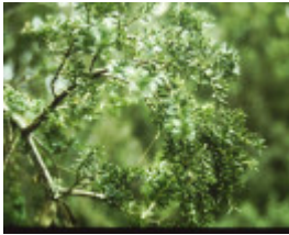
T11042 Podocarpus lawrencei