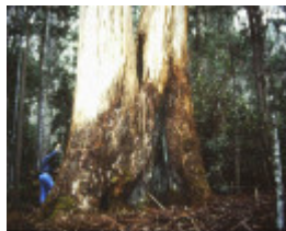
T11052 Eucalyptus denticulata