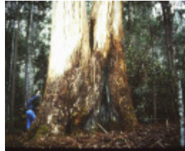
T11052 Eucalyptus denticulata