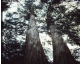
T11052 Eucalyptus denticulata