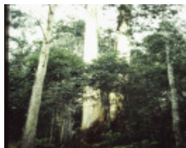
T11052 Eucalyptus denticulata