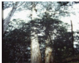
T11052 Eucalyptus denticulata