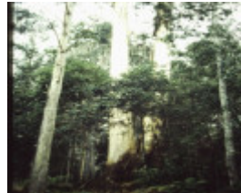
T11052 Eucalyptus denticulata