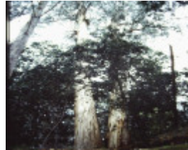
T11052 Eucalyptus denticulata