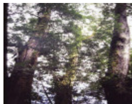
T11054 Nothofagus cunninghamii