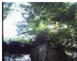
T11054 Nothofagus cunninghamii