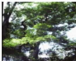
T11054 Nothofagus cunninghamii