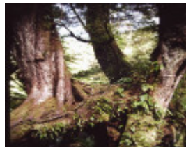
T11054 Nothofagus cunninghamii