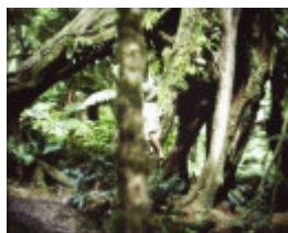
T11054 Nothofagus cunninghamii