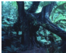
T11054 Nothofagus cunninghamii