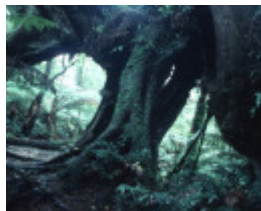
T11054 Nothofagus cunninghamii