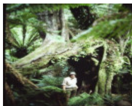
T11054 Nothofagus cunninghamii