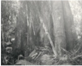
T11055 Eucalyptus regnans